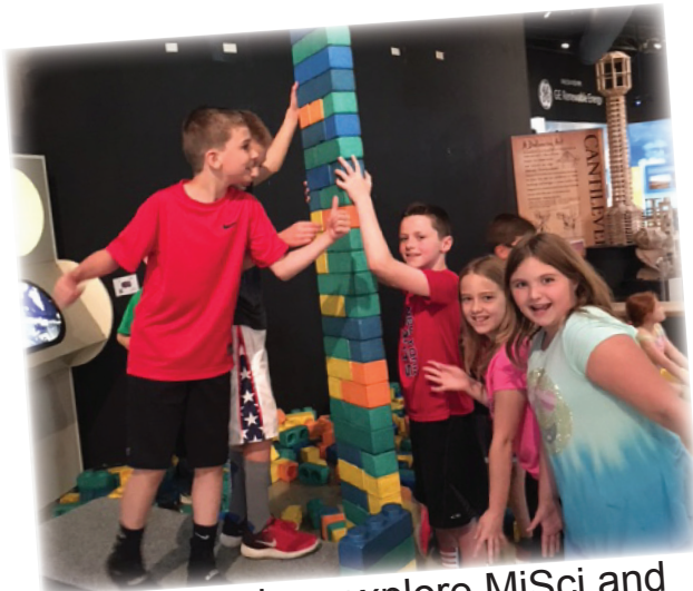
Fourth graders explore MiSci and see a planetarium show all about the Earth.