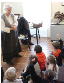
Field Trips PAGE 11