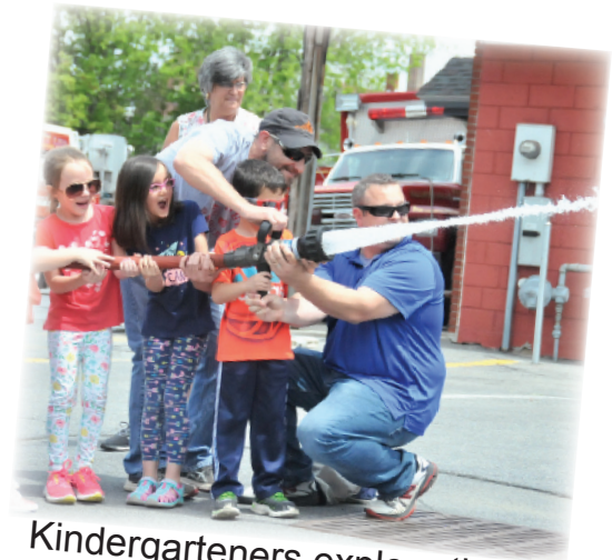
Kindergarteners explore the Village of Ballston Spa.