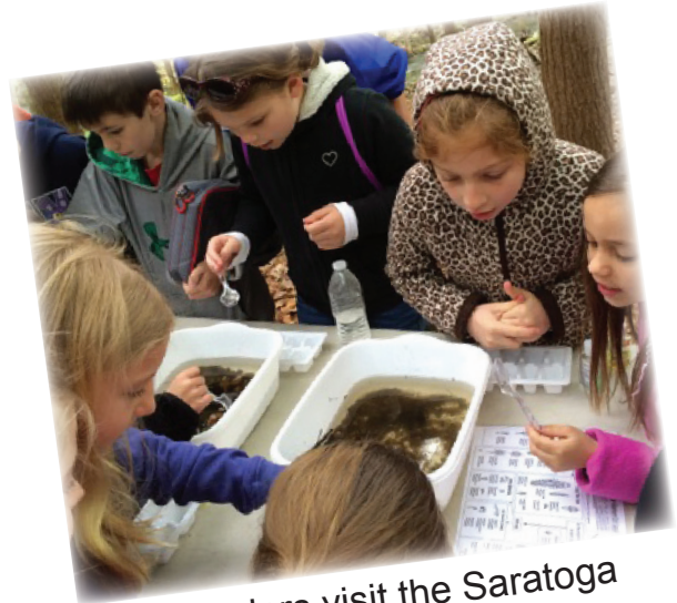
Third-graders visit the Saratoga County 4H Center.