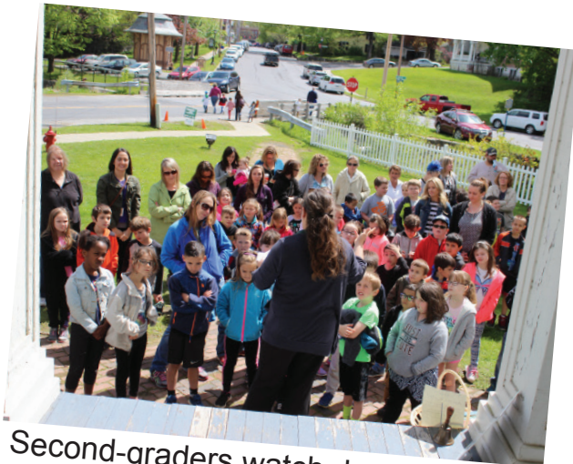
Second-graders watch demonstrations and participate in hands-on activities all about the processing of wool, from shearing a sheep to making a shawl.