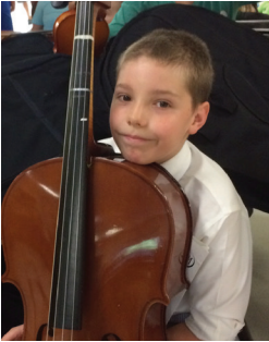
Student Spotlight PAGE 3