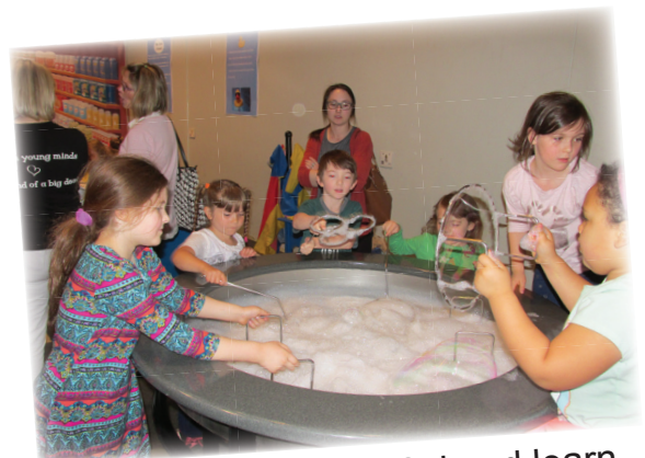
First-graders visit MiSci and learn about the five senses.