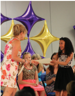
Moving Up PAGE 7