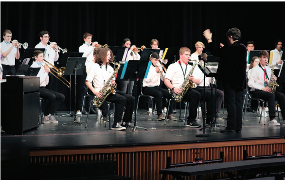
Ballston Spa High School's Jazz Band performed for a packed house at the winter concert.