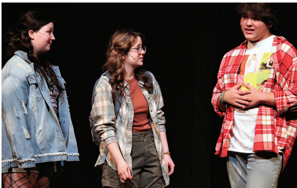
The Troupe's spring production of Mean Girls-High School Edition was a tremendous hit!